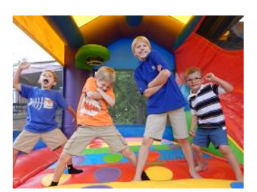
The 11th Annual Family Fun Day was a huge success. See page 2.

September 27th. We're happy to be able to include craft beer vendors this year for the tasting for those of you who are not fans of wine. If you haven't gotten your tickets yet, call the clubhouse right away. Please note that the