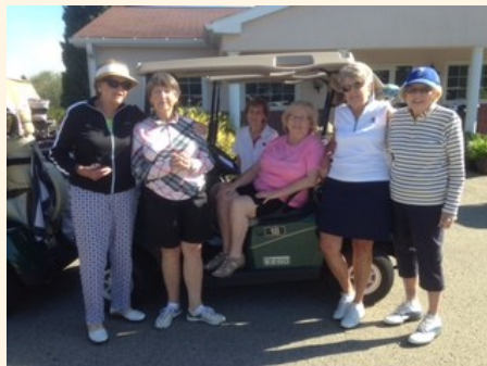
Nine-Holers caught is a rare photo near the end of the season.