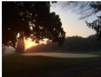
Late July

entered into a drawing: one guest will win a 2015 golf membership, and one member will win $650 worth of prepaid minimum for 2015. We'll also be running our Friends & Family dues deal again beginning August